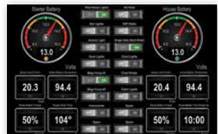
TSM Series Screen Shot